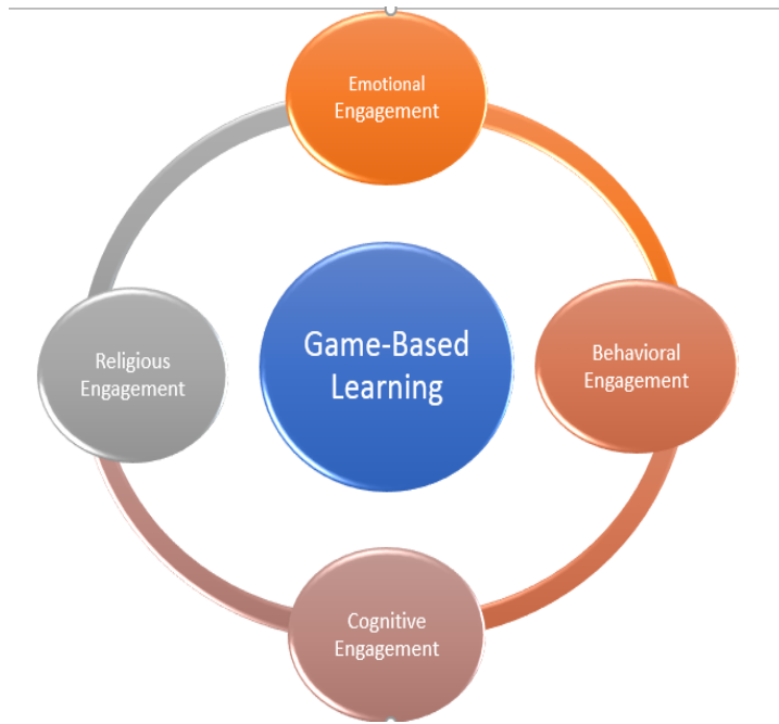
Figure 1: integrated design framework of game based learning